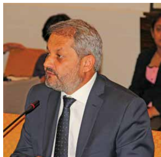
HE DR FEROUZUDDIN FEROUZ, MINISTER OF PUBLIC HEALTH, AFGHANISTAN

The primary objective of the meeting was to enhance cooperation among all stakeholders to work in collaboration for