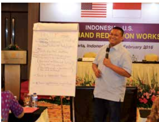
PRESENTATION OF THE WORKING GROUP RECOMMENDATIONS DURING THE WORKSHOP

The final day of the workshop consisted of a working group discussion to identify gaps in prevention and treatment of drug use in Indonesia. The need for policy reforms, capacity building training, development of structures and systems were discussed during the working group sessions. The outcomes of the working groups were presented as a recommendation for future collaboration on DDR programmes by and between the two nations.