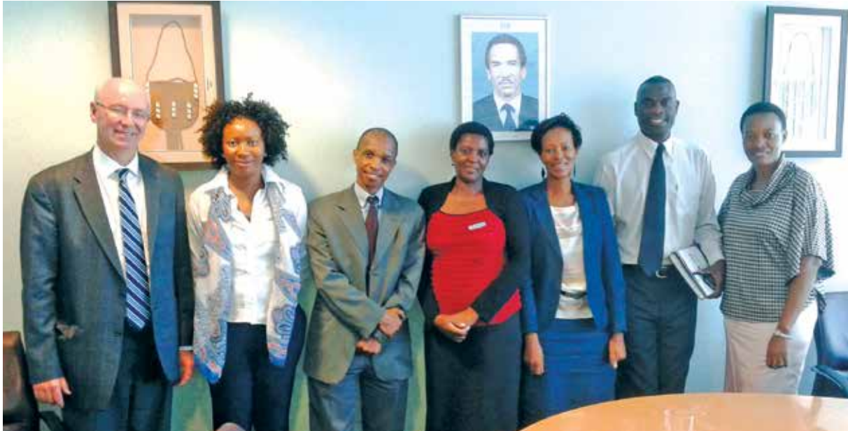
Meeting with Botswana Ministry of Health Officials