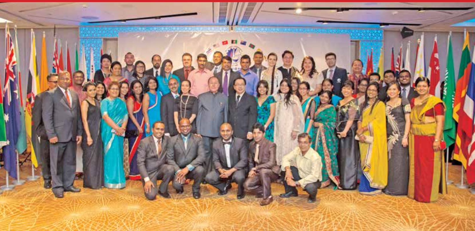
Colombo Plan's 65 th Anniversary celebration, 1 July 2016

For Cooperative Economic and Social Development in Asia and the Pacific