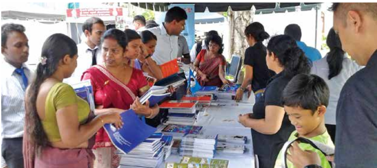
COLOMBO PLAN EXHIBITION STALL BEING VISITED BY THE PUBLIC

COLOMBO – The Colombo Plan Secretariat sponsored the exhibition on drug use awareness which was held in connection to the International Day Against Drug Abuse and Illicit Trafficking from 26 – 28 June, 2015. The exhibition was organised in collaboration with the National Dangerous Drug Control Board (NDDCB) of the Government of Sri Lanka. The Colombo Plan stall was set up along with 40 other stalls, showcasing the ill effects of drugs and free distribution of books and other literature on the prevention and management of substance use disorder. The event started with a public meeting and continued for three days which included different awareness programmes.