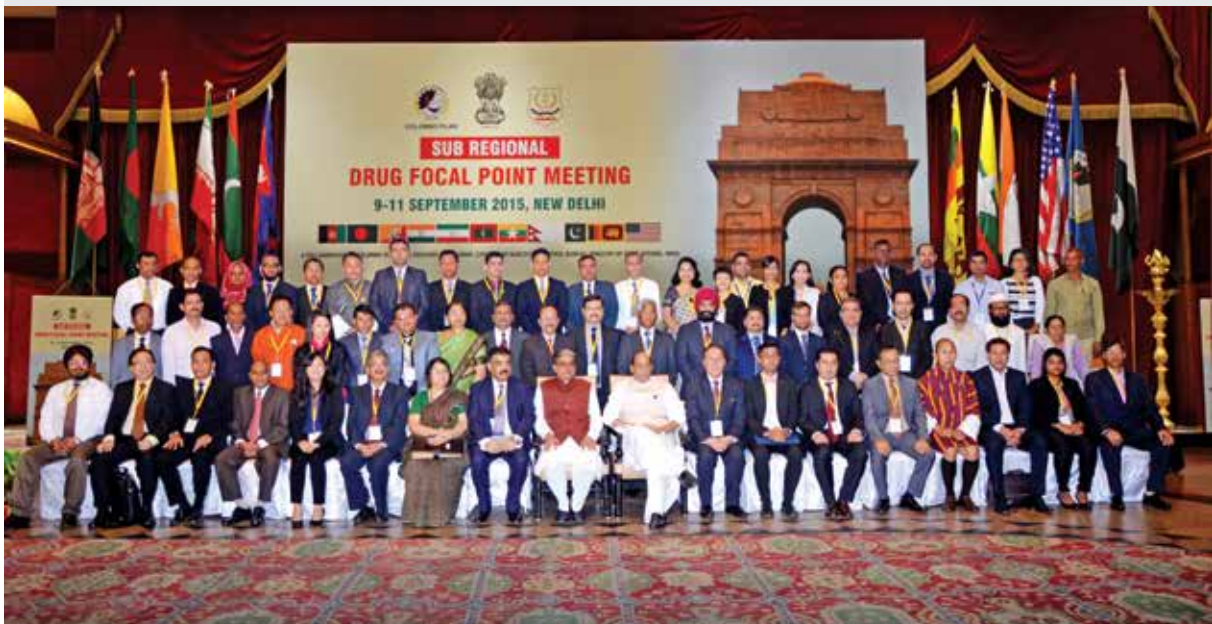
DELEGATES OF THE DRUG FOCAL POINTS OF SOUTH ASIAN COUNTRIES WITH SHRI RAJNATH SINGH, MINISTER OF HOME AFFAIRS

NEW DELHI – The Colombo Plan Drug Advisory Programme (DAP) gathered drug focal point agency officials from the countries of Afghanistan, Bangladesh, Bhutan, India, Iran, Maldives, Nepal and Sri Lanka for the first-ever Sub-regional Drug Focal Point Meeting (SR-DFPM) for South Asia. Co-organising this initiative with DAP is India's Narcotics Control Bureau (NCB) under the Ministry of Home Affairs.