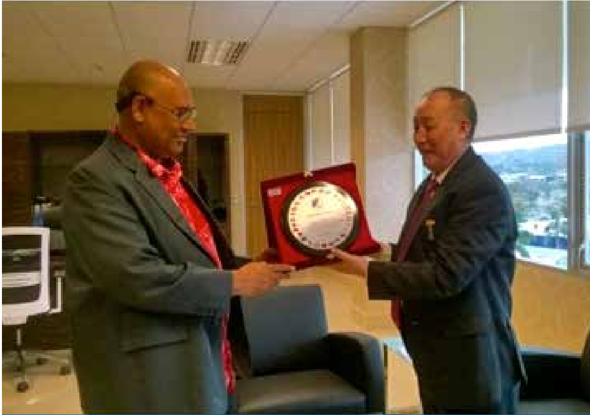
A TOKEN OF APPRECIATION PRESENTED BY MR KINLEY DORJI, SECRETARY-GENERAL OF THE COLOMBO PLAN TO MR WILLIAM DIHM, ACTING SECRETARY, DEPARTMENT OF FOREIGN AFFAIRS, PAPUA NEW GUINEA.