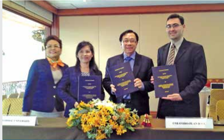
After signing the MoU with Mahidol University

In its continuous efforts to address the global need for a skilled Drug Demand Reduction (DDR) workforce and sustain the dissemination of the treatment and prevention curricula, the International Centre for Credentialing and Education of Addiction Professionals (ICCE) is launching the ICCE Fellowship Programme in August 2016. This initiative, implemented as part of the Colombo Plan's flagship Long-term Scholarship Programme (LTSP), brings mid-career addiction professionals from Asia and Africa to further enhance their professional development in the addiction treatment field in participating universities in the Asian and African regions.