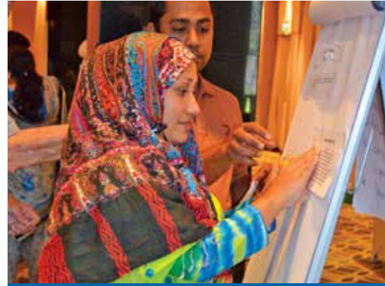
TREATMENT PRACTITIONERS WORKING WITH CHILDREN BENEFIT FROM THE CHILD SUD TREATMENT CURRICULUM WHICH EMPLOYS HIGHLY INTERACTIVE TRAINING METHODOLOGIES

The Child SUD Treatment Curriculum was developed with the aim of providing