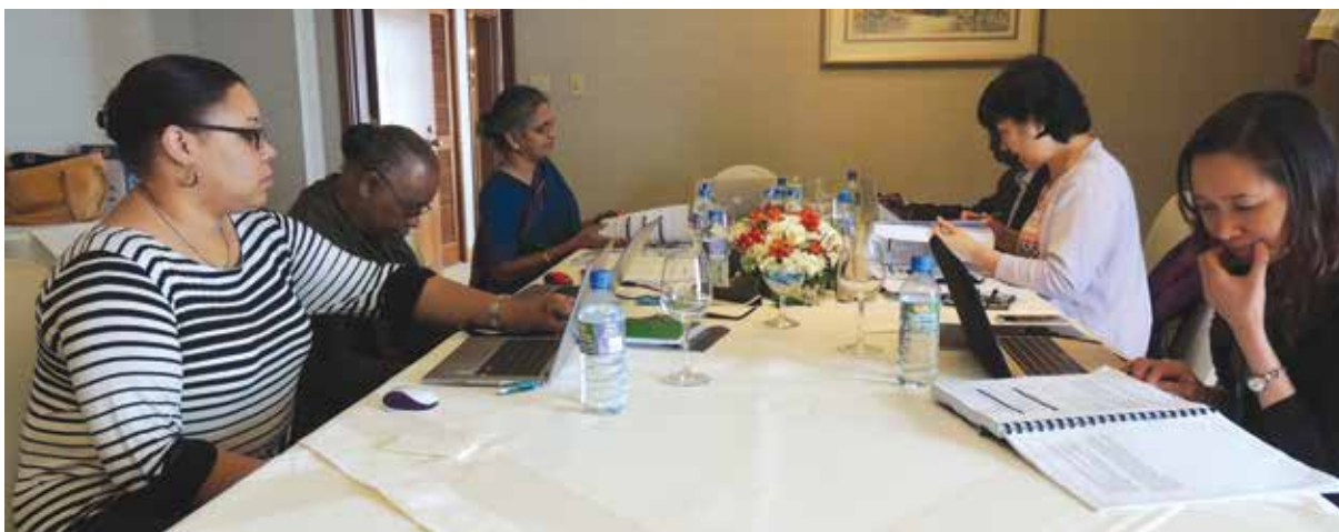
Expert Working Group Review Meeting in Sri Lanka

Advanced Levels manuals was completed through collaborative efforts of the Expert Working Group members and the objectives of the meetings were achieved. This last cycle brought to completion the process of review for the new Advanced Level UTC Courses.