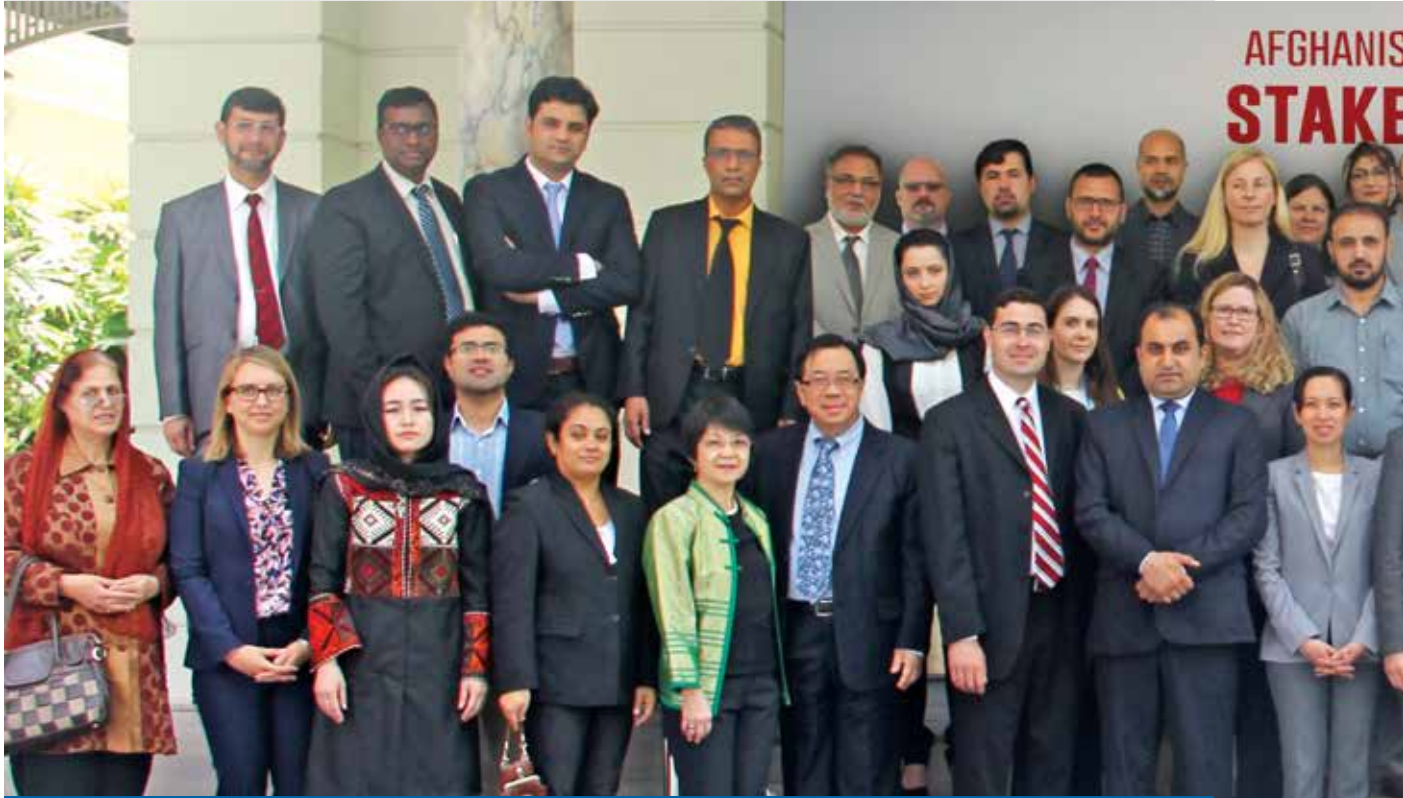
PARTICIPANTS OF THE AFGHANISTAN DRUG DEMAND REDUCTION STAKEHOLDER MEETING

BANGKOK – A meeting of stakeholders working in DDR field in Afghanistan was conducted in Bangkok, Thailand from 20 – 22 May, 2016. This DAP organised meeting with the funding support of INL saw the participation of over 60 participants representing government Ministries, non-governmental organisations (NGOs) and international organisations all working to improve DDR efforts in Afghanistan.