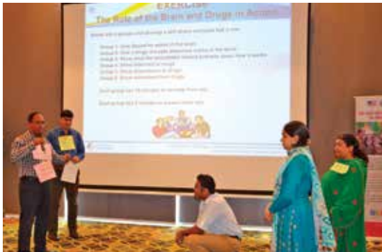
TREATMENT PRACTITIONERS DURING A GROUP DISCUSSION

and suspend disease progression (Course 6 – Principles of Pharmacological Treatment for Children with Substance Use Disorders: A Menu of Options).