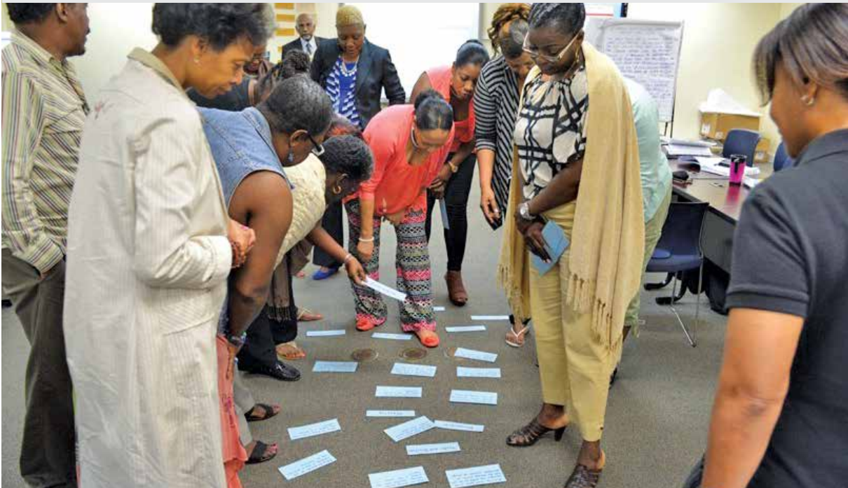
A group activity

Continuing the successful implementation of ICCE initiatives in the Western Hemisphere, the UTC Advanced Level training series was launched in the Bahamas with the training of trainers on Working with Families affected by Substance Use Disorders. Twenty-two drug addiction professionals, who had recently completed the basic level UTC series, participated in this training programme conducted from the 26 to the 30 of April 2016 in Nassau, Bahamas.