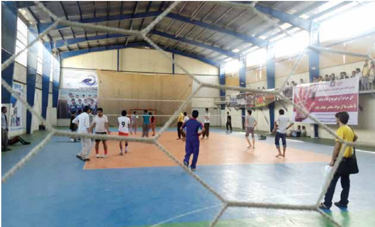
INTER SCHOOL FOOTBALL MATCH AT MOIC