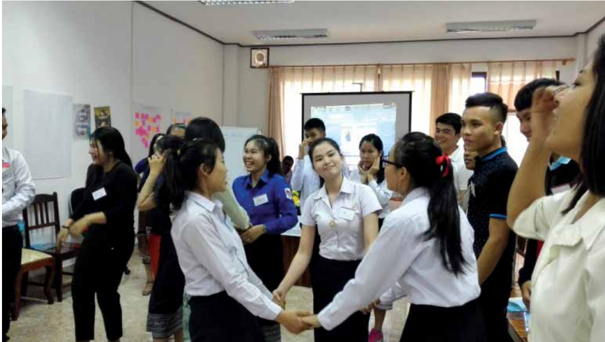
PARTICIPANTS DURING A GROUP ACTIVITY

the closing of the programme. The two training programmes were implemented simultaneously.