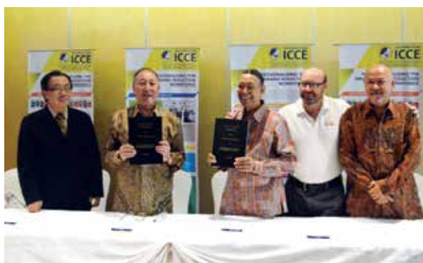
MoU signing with Kasih Mulia Foundation, Indonesia

Support for Addictions Prevention & Treatment in Africa (SAPTA) , Kenyan-based international NGO founded in 2004 also become an ICCE Approved Education Provider on 2 December 2015.