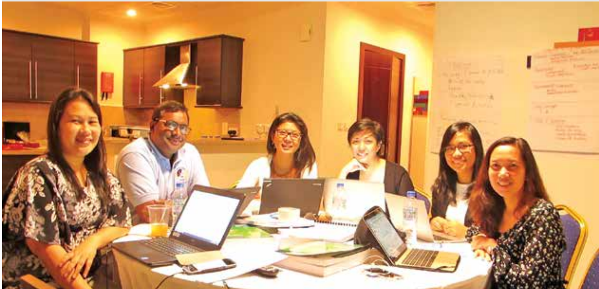
THE EXPERT WORKING GROUP

DUBAI – DAP has been implementing Preventive Drug Education (PDE) in Afghan schools since 2010. The first PDE lessons were piloted in the Afghan provinces of Balkh, Herat, Kabul and Nangarhar and later expanded the project to other provinces. With funding support of The Bureau for International Narcotics and Law Enforcement Affairs (INL), US Department of State, PDE is currently being implemented in 23 out of 34 provinces in Afghanistan.