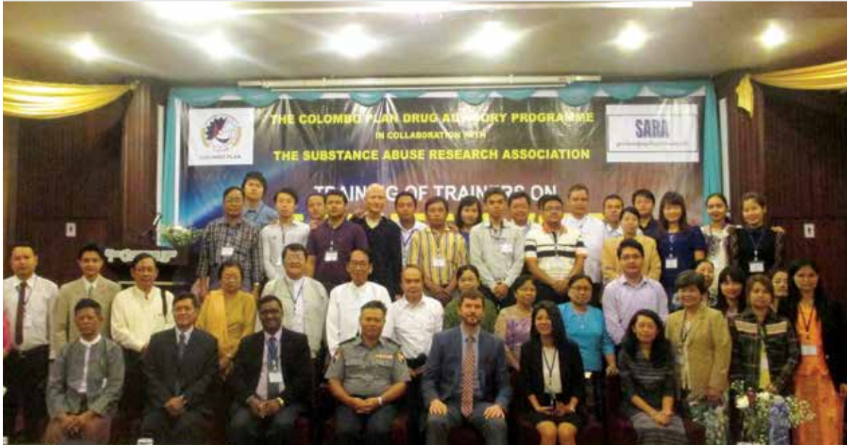
DAP TEAM WITH PARTICIPANTS AND INL OFFICIALS FROM THE US EMBASSY IN YANGON, REPRESENTATIVE OF THE DRUG FOCAL POINT AND OTHER PERSONNEL FROM GOVERNMENT AND CIVIL SOCIETY

YANGON – DAP organised a training of trainers for drug use prevention among in Myanmar. This programme was a cost sharing initiative with the Substance Abuse Research Association (SARA), a pioneering NGO involved in drug demand reduction in Myanmar. The overall goal of the initiative was to train trainers to conduct drug use prevention programmes for youth with specific social skills to increase their protective factors against drug use.