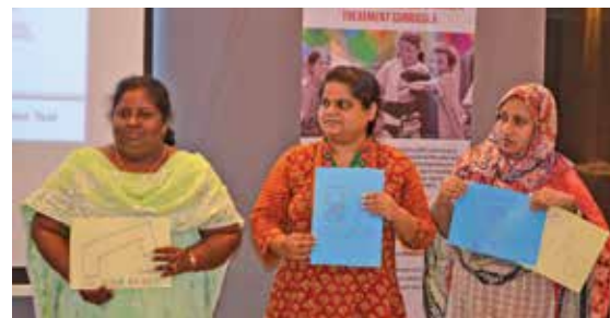
TREATMENT PRACTITIONERS WORKING WITH CHILDREN BENEFIT FROM THE CHILD SUD TREATMENT CURRICULUM WHICH EMPLOYS HIGHLY INTERACTIVE TRAINING METHODOLOGIES

This curriculum is the first of its kind to respond to the unique needs of children with SUDs and their treatment providers. The four courses, trained last year in Dhaka, Bangladesh, include: Course 1 – Overview for Psychosocial Treatment Interventions