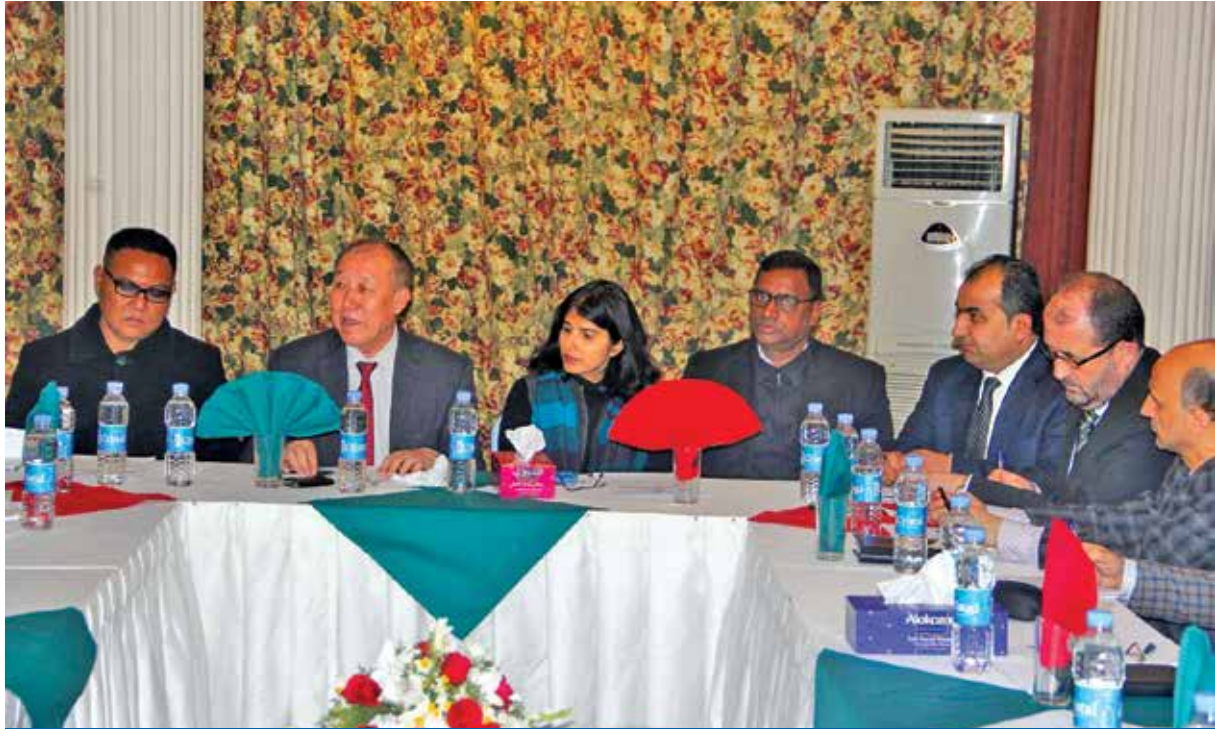
SECRETARY-GENERAL CHAIRING THE MINISTERIAL MEETING