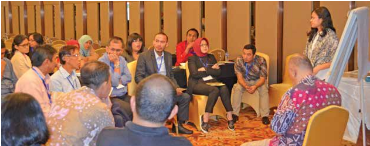
WORKING GROUP DISCUSSION

The three day workshop was conducted in Jakarta, Indonesia on 23 – 25 February, 2016 and saw the participation of approximately 80 individuals representing government and civil society of both nations. International organisations such as Colombo Plan, UNODC and WHO also participated in the workshop.