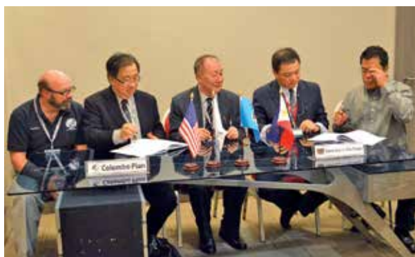
MoU Signing with Serenity in the Steps, The Philippines