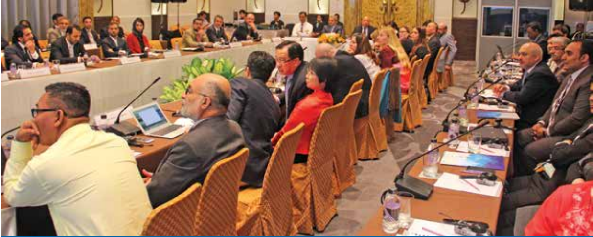
DISCUSSION DURING THE STAKEHOLDER MEETING

actively contributed to the discussions of the meeting. Representatives of 10 NGOs working in Afghanistan was present at the meeting and this enabled the enhancement of mutual cooperation and understanding between NGOs and the government agencies present.