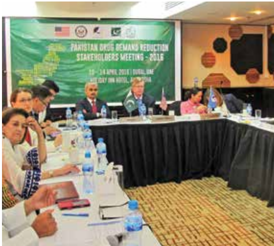
PROVINCIAL GOVERNMENTS' PRESENTATION

and sustainable programmes. Some of the recommendations were rigorous awareness campaign, professionalising service providers and involvement of the government. One key point to note in recommendation for policy is allocating employment quota for rehabilitated persons with SUDs for reintegration into family and society. The meeting also recommended that policy makers should take into account that drug use is a global health issue and be given same focus as other diseases such as HIV. As a result of this meeting, it is evident that Pakistan needs to adopt more comprehensive but effective programmes on SUDs to address both demand and supply reduction.