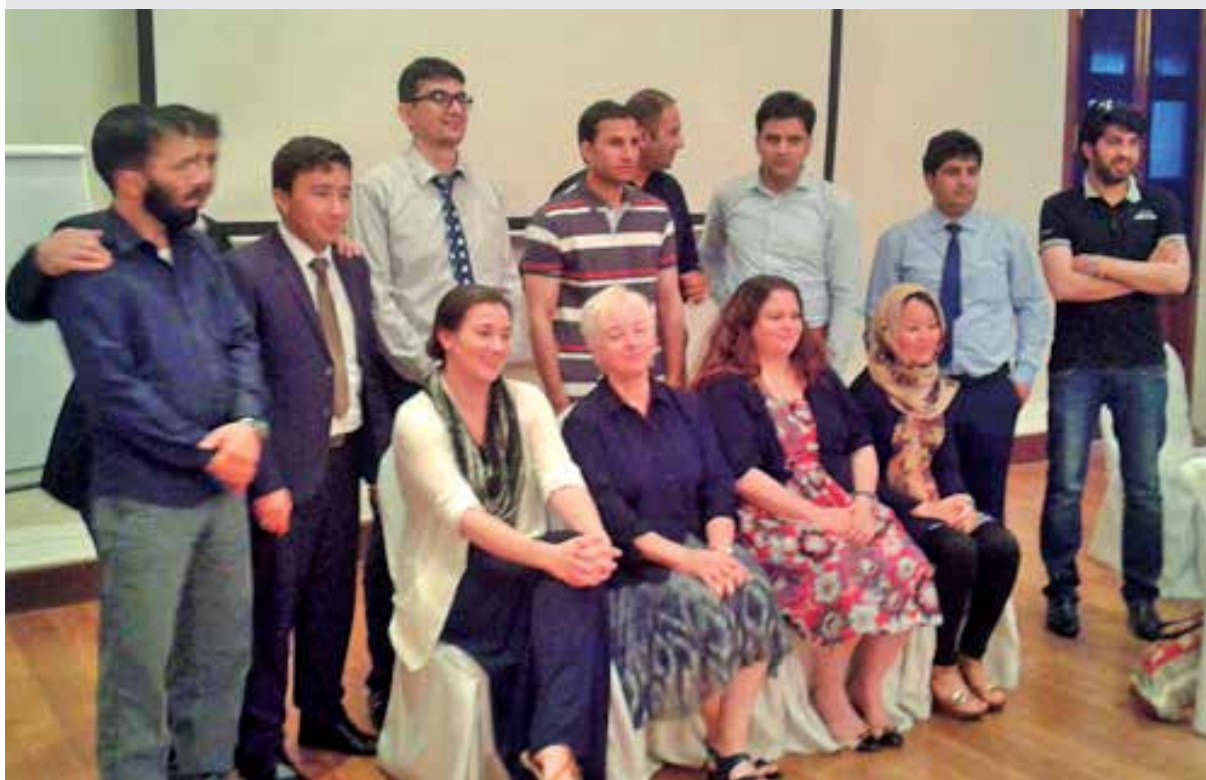
OUTCOME EVALUATION OF DRUG TREATMENT PROGRAMMES MEETING

COLOMBO – DAP with funding support of INL, conducted the study on the outcome evaluation of drug treatment programmes in Afghanistan. This study has the components of (a) assessing changes in illegal substance use and related problems, (b) assessing the implementation of fidelity of the DAP treatment model across participating drug addiction treatment centers, (c) examining the association between success of former patients and the treatment process and (d) examining gender and demographic differences in substance use and related problems