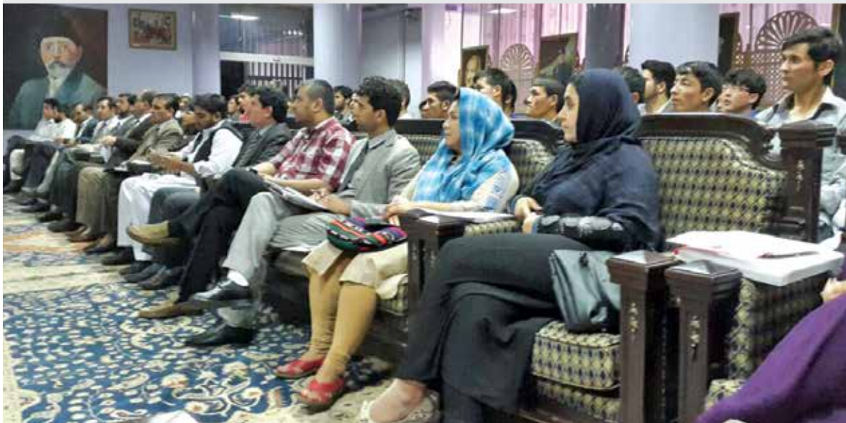
INTER-MINISTERIAL OBSERVATION OF INTERNATIONAL DRUG DAY AT MOIC, KABUL

TO MARK THE INTERNATIONAL DAY AGAINST DRUG ABUSE AND ILLICIT TRAFFICKING