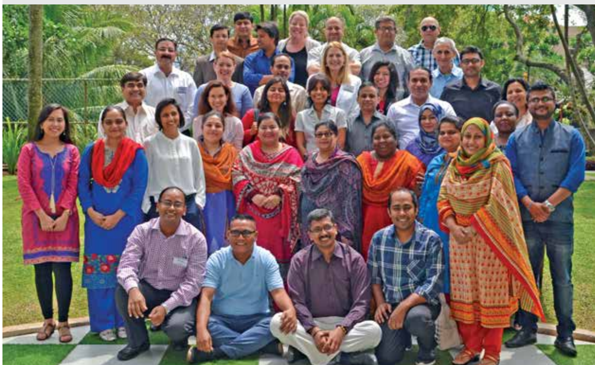
PIONEER BATCH OF TREATMENT PRACTITIONERS AND MASTER TRAINERS FROM SOUTH ASIA TRAINED ON CHILD SUD TREATMENT CURRICULUM

COLOMBO — A pioneer batch of 25 treatment practitioners from the South Asian countries of Bangladesh, India and Pakistan have completed training series on the Child Substance Use Disorder Treatment that ran from 10 – 18 February, 2016.