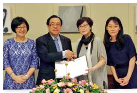
After signing the MoU with Chungnam University