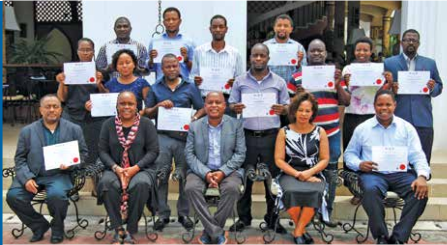
Tanzanian National Trainers

In a population of 51.7 million people, there are only less than 10 drug treatment centres in Tanzania, an inordinately low figure calling for up scaling of drug intervention measures.