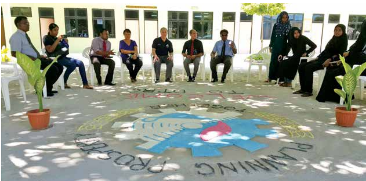
REHABILITATION AND TREATMENT CENTRE (DTRC) IN HIMMAFUSHI

The Secretary-General of Colombo Plan Mr Kinley Dorji paid a courtesy visit to the Foreign Ministry and the Rehabilitation and Treatment Centre (DTRC) in Himmafushi, Republic of Maldives.