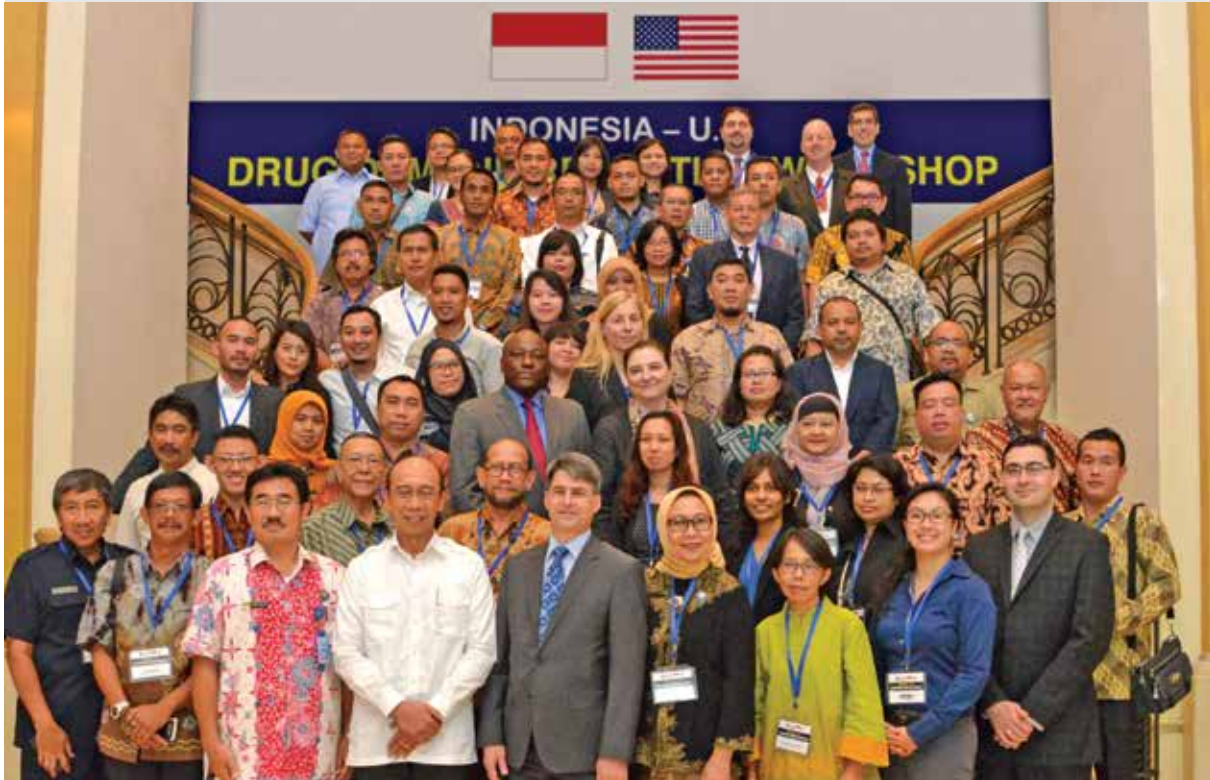
PARTICIPANTS OF THE INAUGURAL INDONESIA – UNITED STATES DRUG DEMAND REDUCTION WORKSHOP