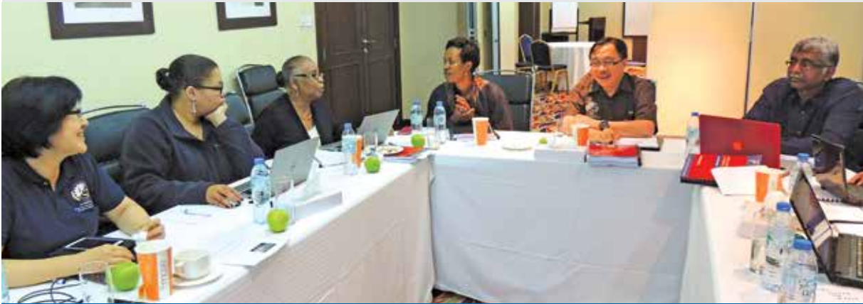
Expert Working Group Review Meeting in UAE

ICCE convened the Expert Working Group review meetings (EWG) in its effort to facilitate the completion of the Advanced Level UTC courses development. The EWG review is the first of the seven-step of curriculum development process. It aims to assess the content of each curriculum and look into the content, structure and organisation of materials. It also tries to ensure that the materials contained the latest and up-to-date information that will enhance the knowledge and skills of practitioners in particular areas covered by the course. The process is also meant to identify content gaps and offer recommendations for its further development.