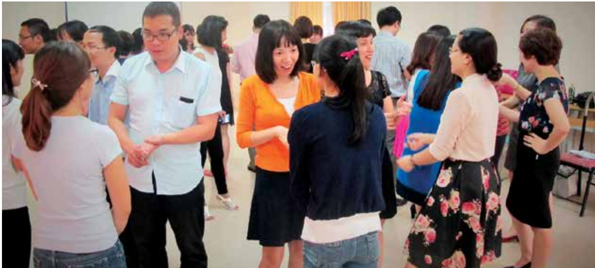
TEACHERS AND STUDENTS OF ULSA DURING A GROUP ACTIVITY

to conduct this one day seminar. The journalists who took part in the seminar also drafted an action plan on how they intend to use media for drug prevention messages through various media productions.