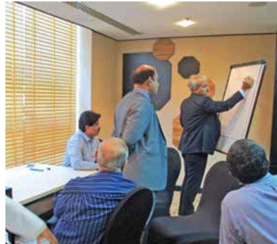
MR HABIB TAKES PART IN THE GROUP DISCUSSION

As one of the main objectives of the meeting, the Pakistani Provincial Government and NGOs representatives identified gaps and recommended solutions for prevention, treatment and policies in Pakistan. Recurring in all three topics were lack of evidence-based practices, coordination/support from government, understanding of addiction