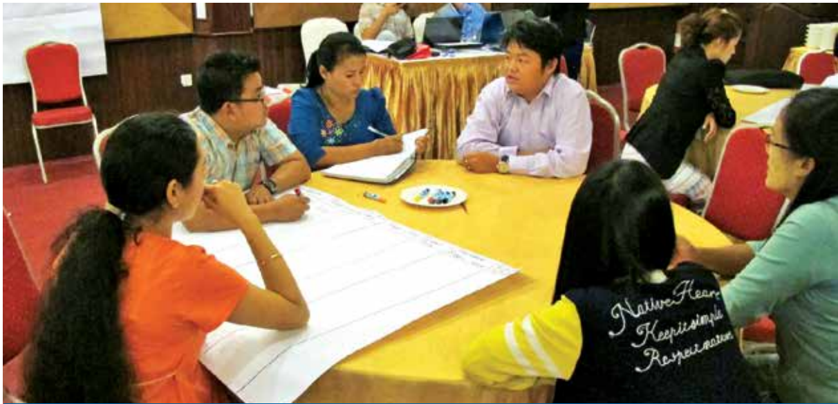
DEVELOPING ACTION PLAN

module on youth life skills for drug use prevention, which includes topics like Science of Drugs, spectrum of addiction, risk and protective factors, self-esteem, communication skills, assertion skills, decision-making skills and coping skills, and a teach back exercise.