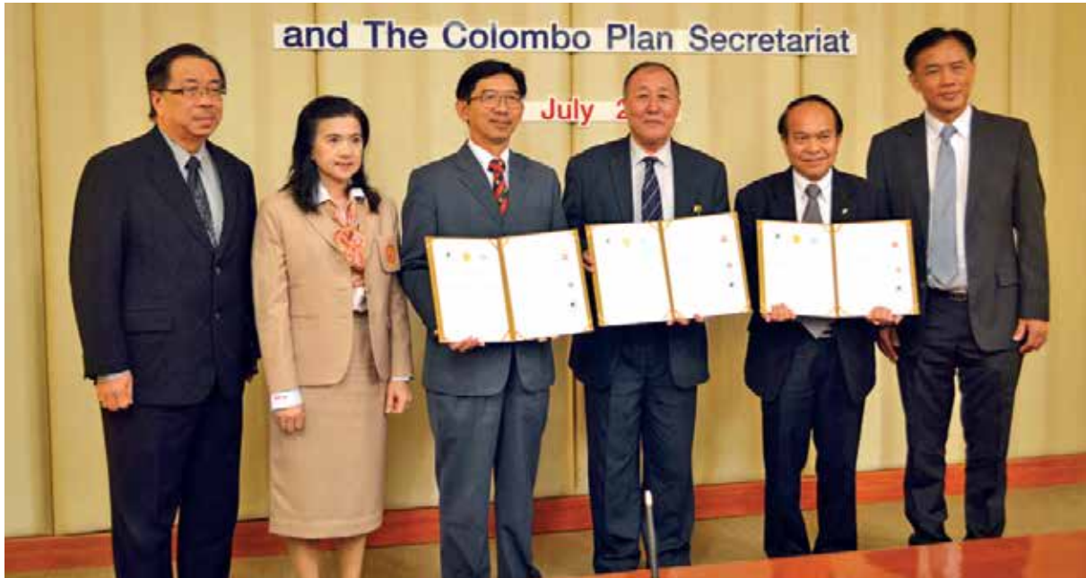
MOU Signing with Faculty of Nursing of Thammasat University and Princes Mother National Institute on Drug Abuse Treatment

In addition, three non-profit organisations in the Philippines i.e. Living Free Foundation Inc. (LFFI), operating since August of 1998 focusing on the recovery and continuing care activities of individuals and families affected by substance use disorder, Serenity in the Steps (SITS), formerly known as Serenity at the Quarry, Counselling and Consultancy facility focused on servicing treatment needs