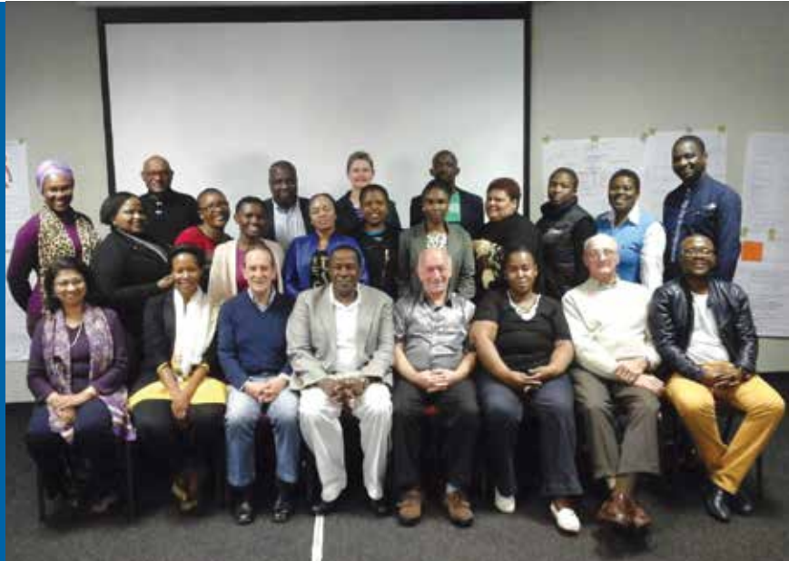
South African National Trainers

South Africa has made significant strides in the fight against drugs and substance abuse. A firm zero-tolerance and comprehensive approach to tackling drugs has worked to some extent in trying to keep the population free from drugs. However, new emerging trends indicate that, in recent years, more young substance abusers aged below 20 years have been arrested. The South African Central Drug Authority (CDA) has received numerous requests from less privileged populations for placement into treatment facilities. A significant rise in 'cluster abuse' of Nyaope, a powerful depressant and hallucinogen (combination of heroin, marijuana and others...), has been noted among many youth. The profiles of youth abusers have also changed, with many coming from middle-class families and those doing well in school. The South African National Drug Master Plan (NDMP) concludes that there is dire need of