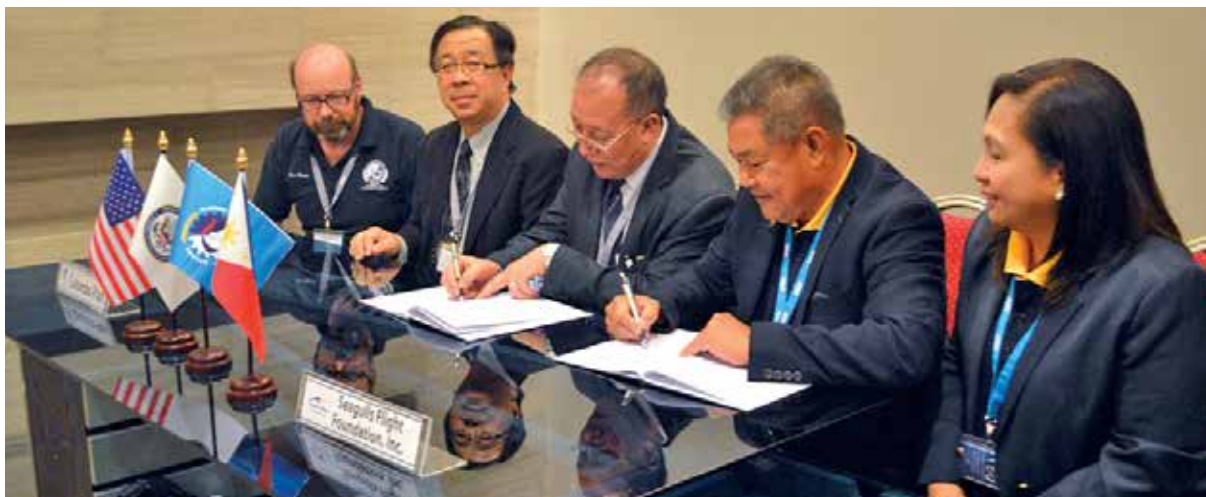
MoU Signing with Seagulls Flight Foundation Inc., The Philippines

Two more organisations in the field of drug demand reduction joined as ICCE Approved Educations Providers during the International Recovery Symposium held from 9 – 13 October 2015 in Colombo, Sri Lanka.