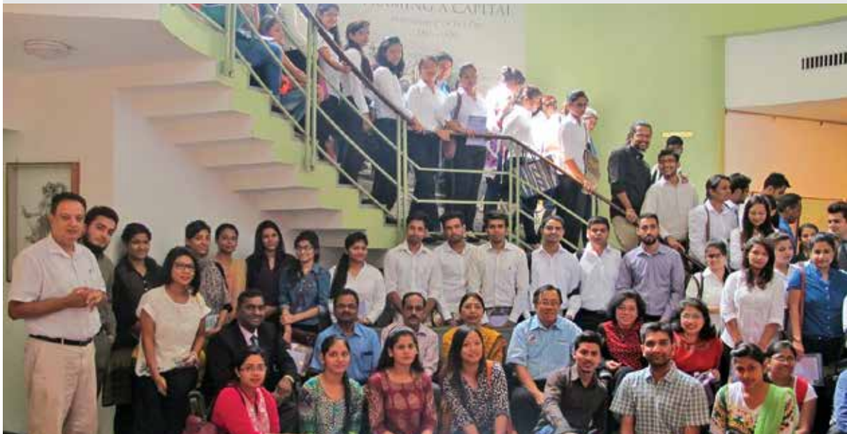
YOUTH LEADERS FROM ACROSS INDIA TOOK PART IN THE THREE DAYS TRAINING IN NEW DELHI

NEW DELHI - DAP initiated the First Indian Youth Forum on Drug Use Prevention in collaboration with the Society for Promotion of Youth and Masses, (SPYM) in New Delhi from 6 – 8 September 2015.