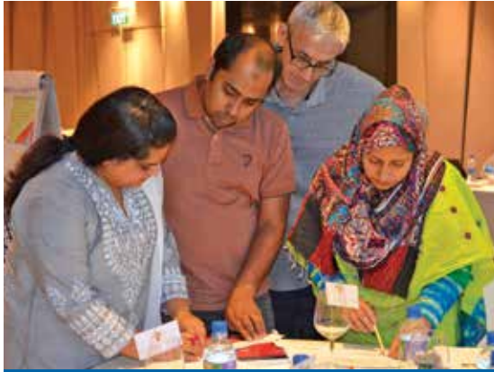
TREATMENT PRACTITIONERS DURING A GROUP DISCUSSION

and suspend disease progression (Course 6 – Principles of Pharmacological Treatment for Children with Substance Use Disorders: A Menu of Options).