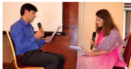
LEARNING BY DOING. CASE SIMULATIONS AND GUIDED GROUP REFLECTIONS WERE THE MAIN MODALITIES USED IN THIS TRAINING FOR TREATMENT PRACTITIONERS ON CURRICULUM 3 – MOTIVATIONAL INTERVIEWING FOR CHILDREN WITH SUDS