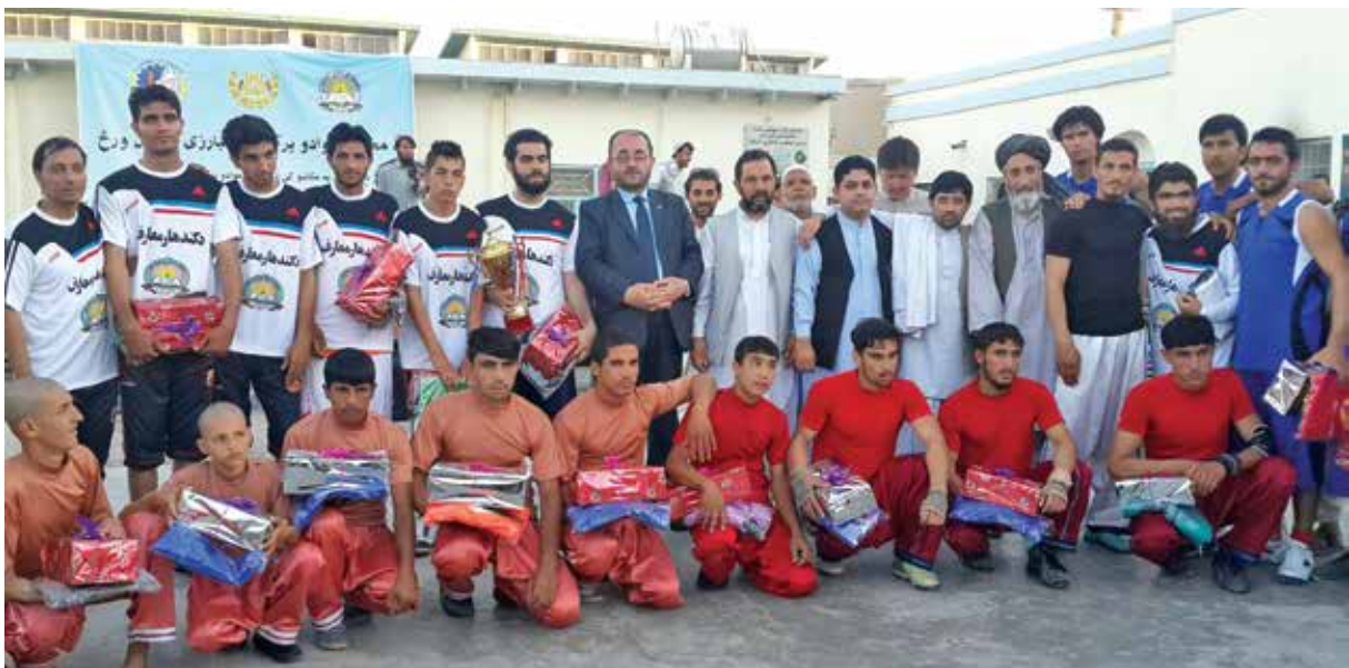
SPORTS EVENT IN ZAHIR SHAHI SCHOOL IN KANDAHAR