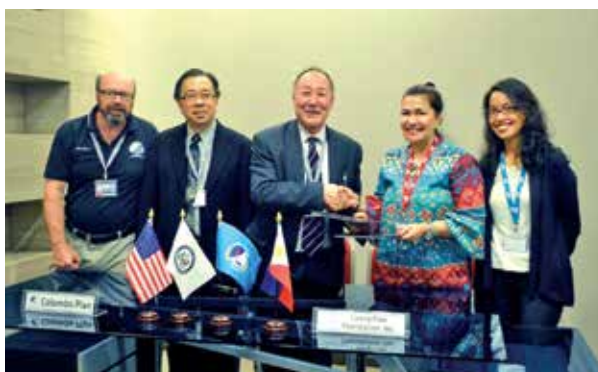
MoU signing with Living Free Foundation Inc., The Philippines

of People with Substance Use Disorder and Seagulls Flight Foundation Inc. (SFFI), one of the most trusted and professional entities in the field of substance use treatment and rehabilitation in the Philippines with 16 years of experience also signed MoUs for ICCE Approved Education Providers on 10 July 2015 in Bangkok, Thailand during the ISSUP International Workshop.