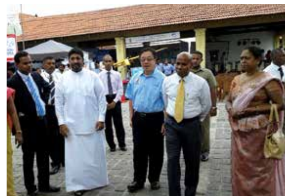
HON. MINISTER MR RUWAN WIJEWARDHANE