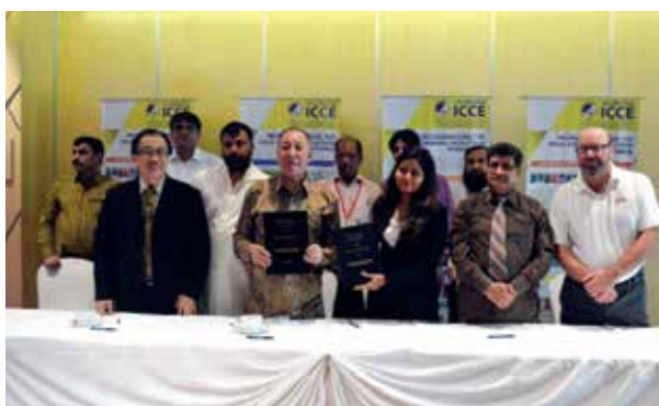
MoU Signing with Drug Free Pakistan Foundation, Pakistan

has been working since 2002 in the field of Drug Treatment and Prevention signed the MoU as ICCE Approved Education Providers on 13 October 2015. The MoU with Kasih Mulia Foundation (KMF) which was founded on October 21, 1998 with the vision to provide service of loving care for humanity also signed the MoU on the same day.