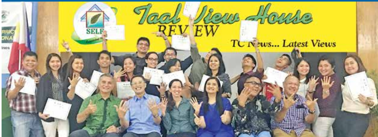
PARTICIPANTS WITH THEIR CERTIFICATES

BANTANGAS CITY – As a joint collaboration of Self Enhancement Life Foundation (SELF) and DAP, the training was held in Bantangas City from 10 – 18 May 2016. The training was supported by the Dangerous Drug Board (DDB) and the Department of Health (DOH) of the Republic of the Philippines.