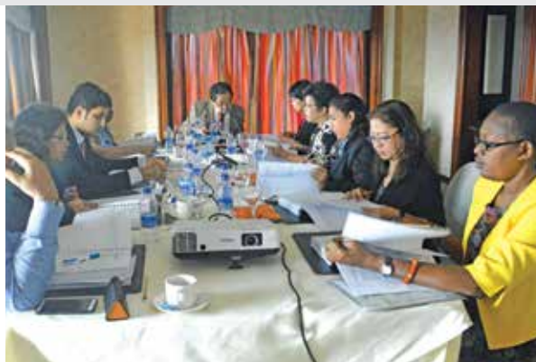
Expert Working Group Meeting in progress