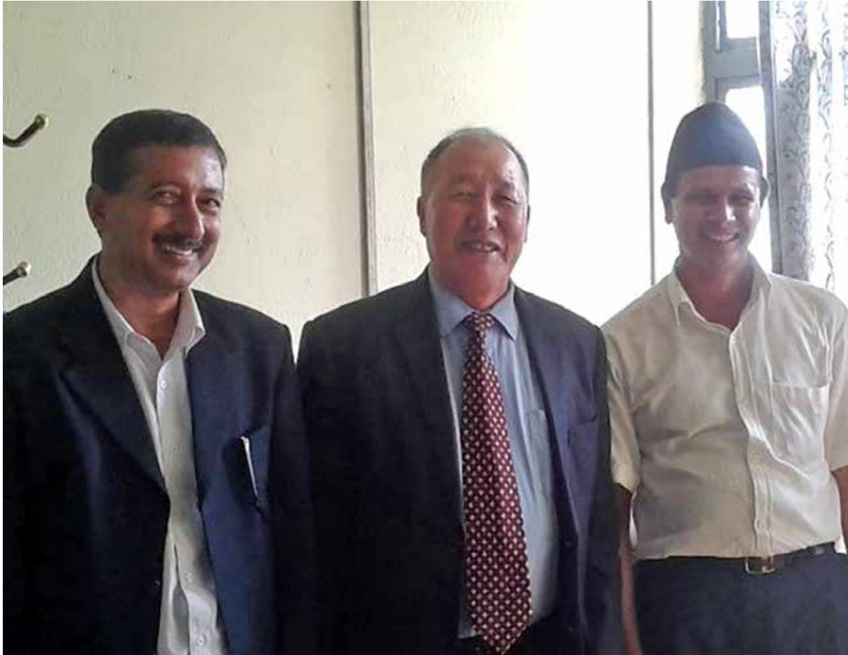
SECRETARY-GENERAL WITH FOCAL POINT OFFICIALS IN NEPAL