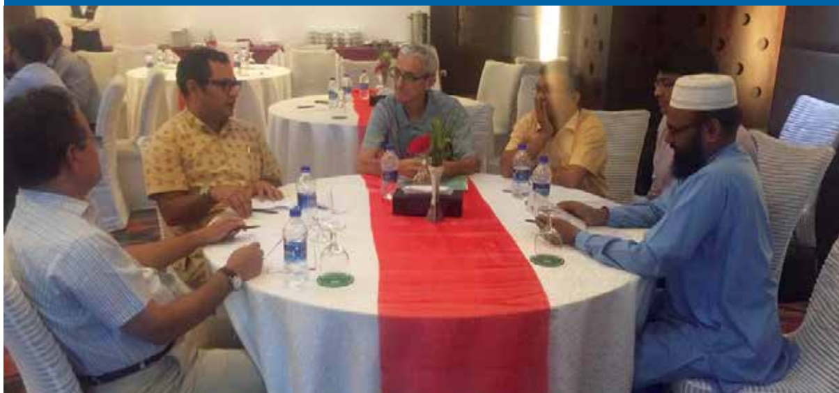
A group discussion

The International Centre for Credentialing and Education of Addiction Professionals (ICCE) conducted the Training of Trainers (TOT) on Basic Level Universal Treatment Curriculum for Substance use disorders Addiction (UTC) Curriculum 3; Common Co-occurring Mental and Medical Disorders and Addiction Professionals for the national trainers of Bangladesh from 29th to 31st May 2016. This three-day training was attended by 14 Bangladeshi national trainers of varied backgrounds from government and non-government organisations. This marked the completion of ToT on UTC Basic Level for Bangladesh.