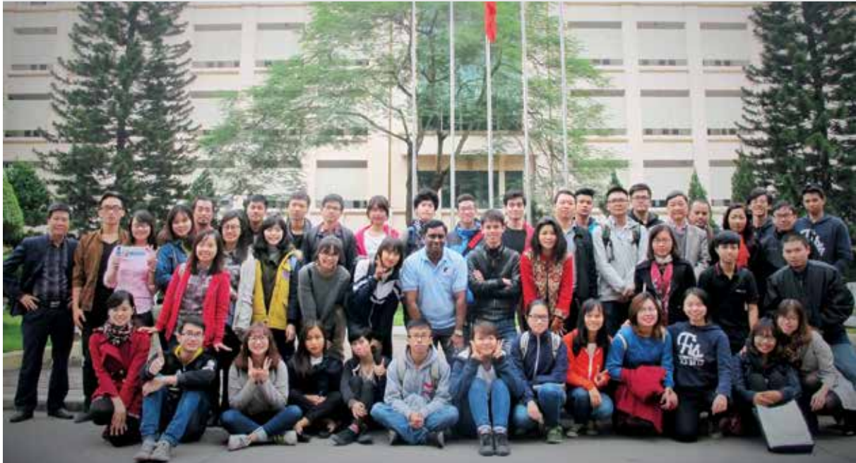
DAP TEAM WITH OFFICIALS FROM THE GOVERNMENT OF VIETNAM, AND OFFICIALS AND STUDENTS OF THE HANOI UNIVERSITY

HANOI – Three different ministries and the Prime Minister’s Office collaborated with DAP in organising three initiatives in drug prevention for Vietnamese youth from 21 – 28 November, 2015. The overall goal of these initiatives were to train youth drug use prevention with specific social skills to increase their protective factors against drug use.