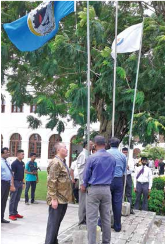
HE KINLEY DORJI, SECRETARY-GENERAL OF COLOMBO PLAN INAUGURATING THE EXHIBITION

COLOMBO – The Colombo Plan Secretariat sponsored the exhibition on drug use awareness which was held in connection to the International Day Against Drug Abuse and Illicit Trafficking from 26 – 28 June, 2015. The exhibition was organised in collaboration with the National Dangerous Drug Control Board (NDDCB) of the Government of Sri Lanka. The Colombo Plan stall was set up along with 40 other stalls, showcasing the ill effects of drugs and free distribution of books and other literature on the prevention and management of substance use disorder. The event started with a public meeting and continued for three days which included different awareness programmes.